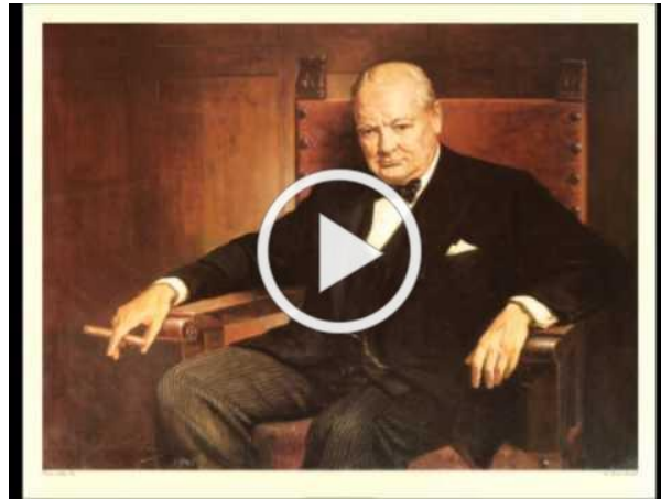
Winston Churchill - Address To Harrow School

This month's historical video features audio from Winston Churchill's famous "Never Give In" speech at Harrow School on October 29, 1941. The full text is available here .