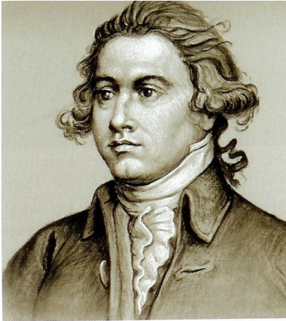
Thomas Lynch, Jr.

Thomas Lynch Jr. (August 5, 1749 - 1779) was a signer of the United States Declaration of Independence. He a representative of South Carolina. Lynch became a company commander in the 1st South Carolina regiment in 1775 and was elected to the Continental Congress. Sadly, Thomas Lynch Jr. died at a young age in ship wreck.