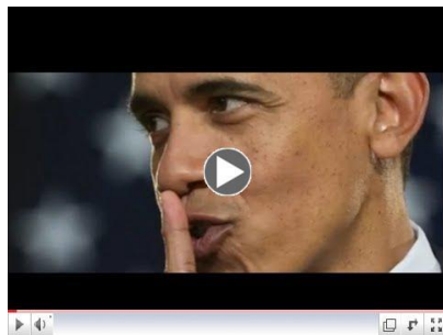
Footage of Obama's true feelings against Christianity. (Parental discretion advised as

We appreciate Christian leaders like Michael Farris, Tony Perkins, and Gary Bauer for trying to alert America to Obama's hostility towards Christianity. We need a new president who will defend religious freedom in America.